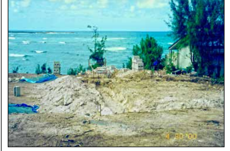
Visions of Naty's home—from Version 0.0, a bare, coral hillside, through Version 1.0, introducing trees and plants to her windswept hillside, to Version 2.0, incorporating a wide variety of bromeliads throughout her property.